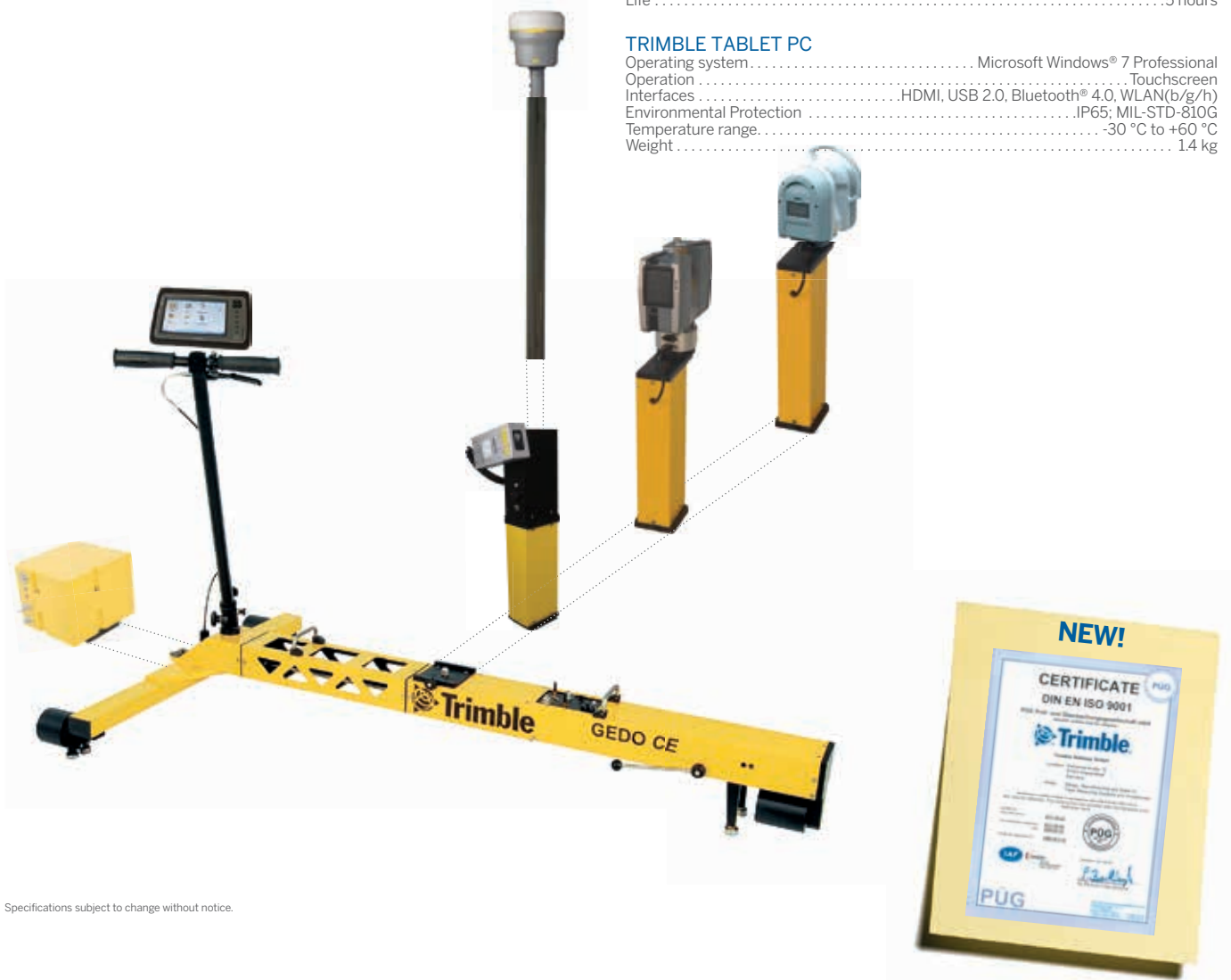
Specifications subject to change without notice.

Operating system ..... Microsoft Windows® 7 Professional Operation ..... Touchscreen Interfaces ..... HDMI, USB 2.0, Bluetooth® 4.0, WLAN(b/g/h) Environmental Protection ..... IP65; MIL-STD-810G Temperature range ..... -30 °C to +60 °C Weight ..... 1.4 kg